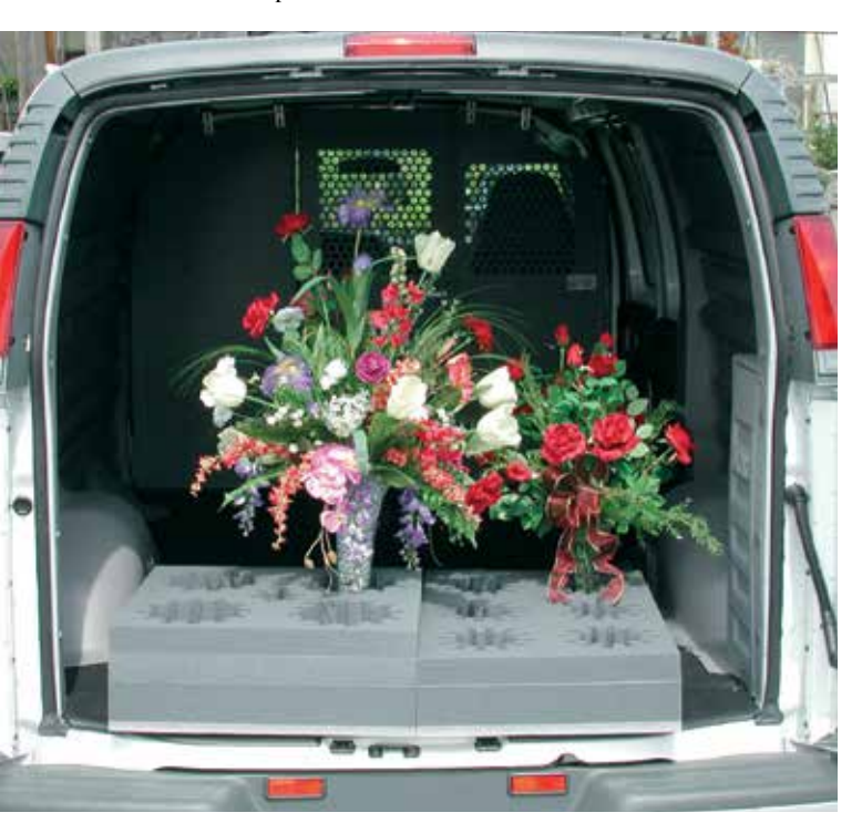
The Transporter 10<sup>®</sup> system.

His first venture in the horticulture field came after he watched a program on the Discovery Channel about growing lettuce hydroponically. He went to the library to learn more and took a graduate course in horticulture at Virginia State. "I got hooked on horticulture and the head of the university put me on a committee to restructure the horticulture program." He believes that education comes through experience and reading. "The way to learn is to open a book. Education is the foundation to start success and experience is the formation of success."