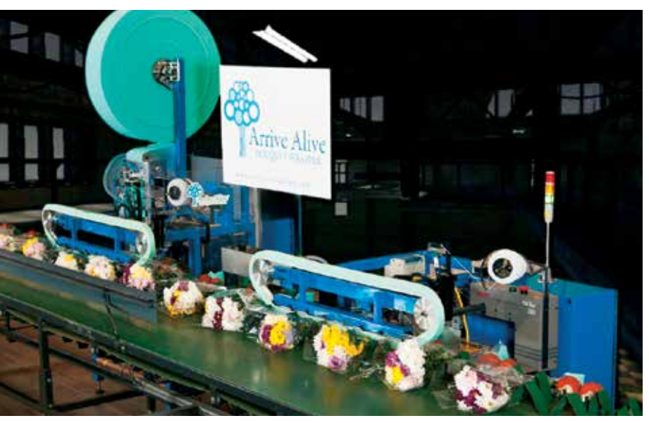
The Arrive Alive® Bouquet Wrapper wraps bouquets at a minimum of 15 to 20 per minute.

"Flowers have to have enough water to drink when stressed but less is more. They do not need to be drowned in water. The product line continues because of consumer awareness that Arrive Alive<sup>®</sup> ensures cut flower quality. The difference this system makes is to give consumers more confidence in cut flower purchasing."