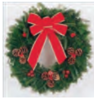
A popular Groupon featured fresh Christmas greens.

It's important to remember that Groupon is a form of advertising. Groupon collects the money the