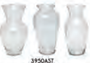
Van's #292298 7,28" PETITE VASE TRIO PLAIN Opening 3,75", 2,375", 7,5" 12/Case