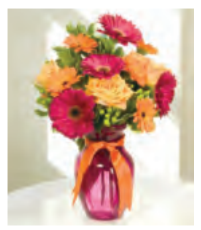
Colorful vases are nice with simple, elegant spring arrangements for any occasion.