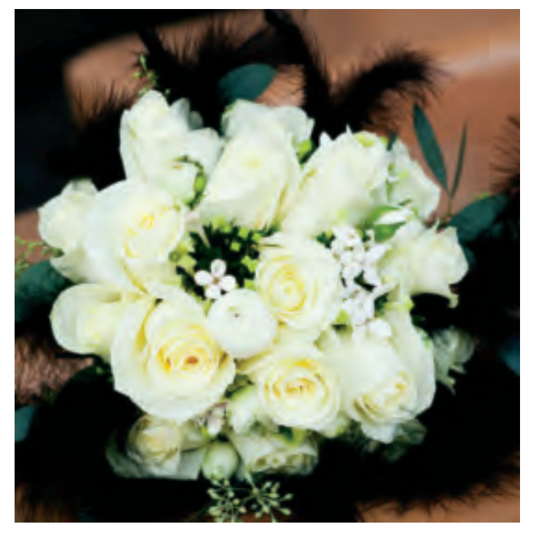
Vintage events are hot in the wedding industry, and floral designers have great potential for making the look modern and new.

Venue selection may be limited based on one's budget, but considering all the options will help you in selecting the right location for a retro look. Keep in mind that you don't want to choose a venue that you will have to compete with for décor and lighting. If the space doesn't look vintage without décor, it may