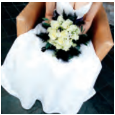
A splash of feathers gives a nice vintage touch.