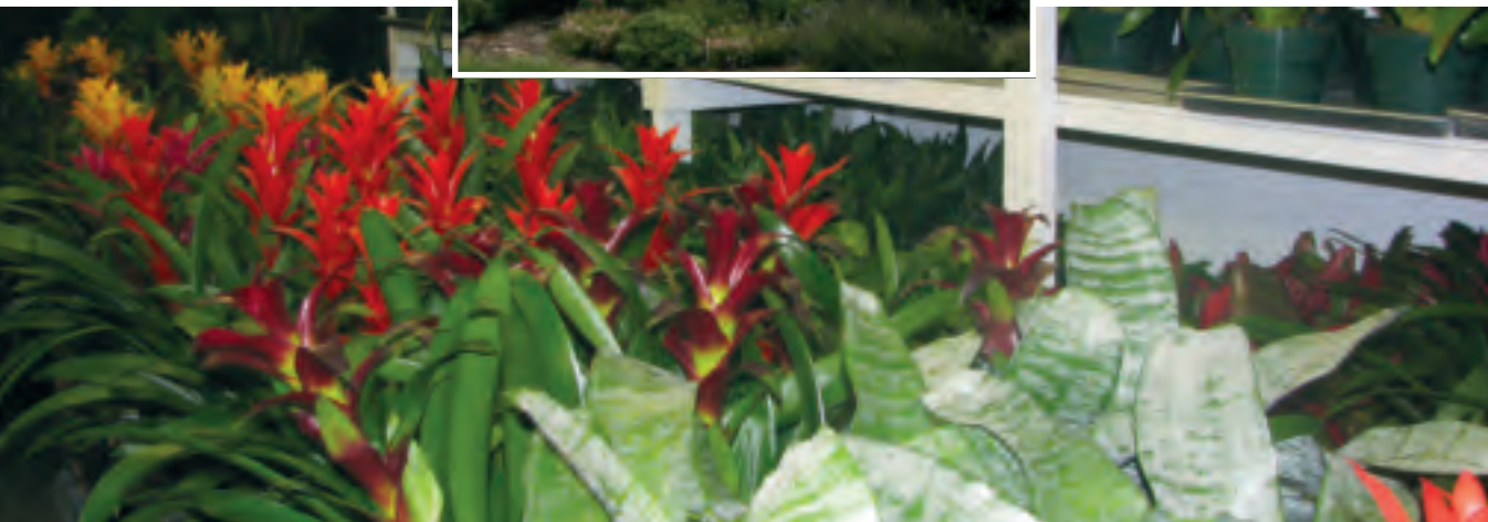
Rows of bromeliads, which are plants from the pineapple family.

The Plant Professionals is located in Lansing, MI.