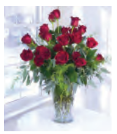
This 12-inch tall glass vase holds up to three-dozen roses comfortably.