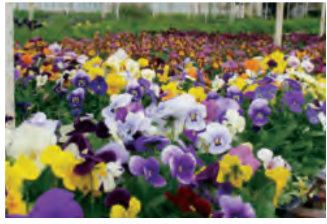
Customers come to Hastay's for a pop of color during the dreary winter. Rows of flats fill up one part of seven greenhouses.