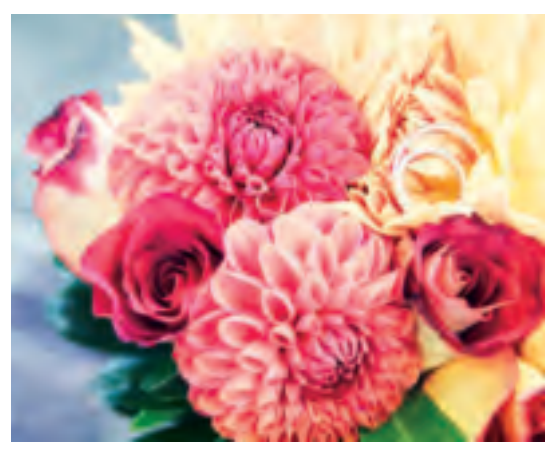
Peonies, garden roses and ranunculus are good vintage-look choices.

Even lighting can be vintage. Think back to a simpler time, before modern day technology. Imagine being the guest for dinner at an old Inn. You would see no fluorescent lighting and no LED's. Soft amber chandelier glow, lamplight and collections of candles are great examples of vintage lighting. When used in