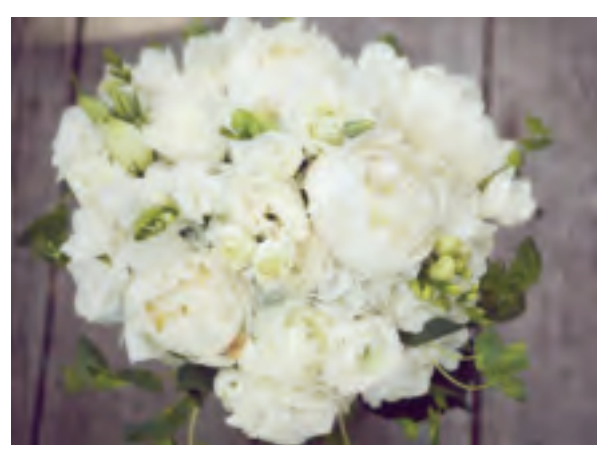
Large blossoms make the simplest design a dynamic arrangement.