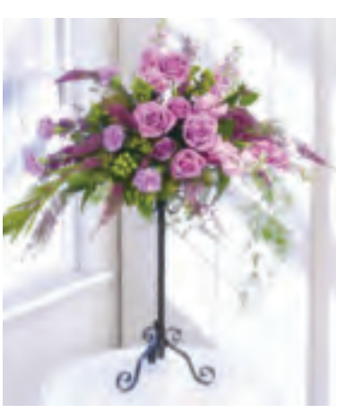
This 25-inch tall metal stand with a 9-inch opening is great for party or wedding work.