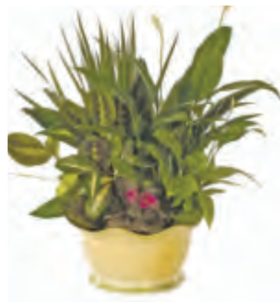
These containers work great with dish gardens.